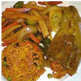
Peas and Rice with Vegetable Medley