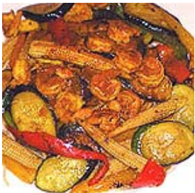
Shrimps with Vegetable