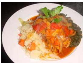
Stew Fish over Rice

Phone: 718-623-3623 Fax: 718-623-3624 Email:folukie@aol.com www.folukie.com